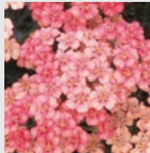
Achillea 'Apricot Delight'