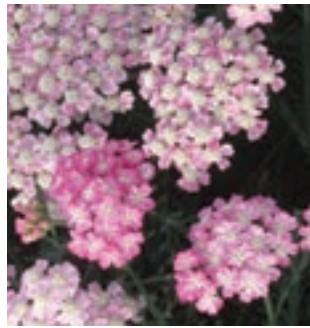
Achillea 'Wonderful Wampee'