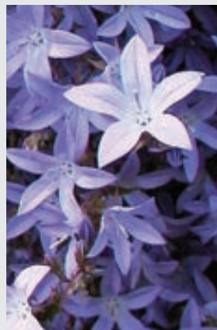
Campanula Blue Waterfall