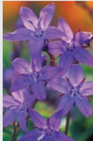
Campanula 'Blue Rivulet'